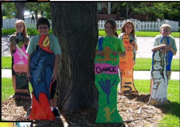
left: Participants in the j.doe revisited workshop have an outing with their self portraits.