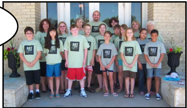
above: Campers and instructors of 2009 Art Camp (not pictured, art instructor, Gretchen Peters).