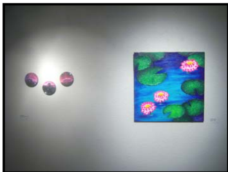
Christina Armstrong, Horse Head Nebula , 2008. acrylic; Illusion , 2009. acrylic.