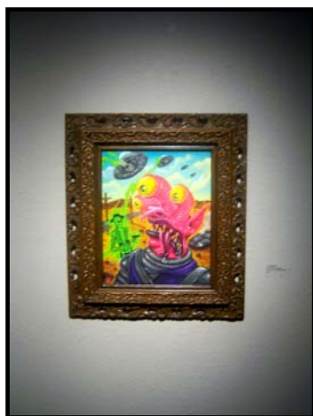
Ty Armstrong, Leonard from Googylon Explores the New World , 2009. acrylic on canvas